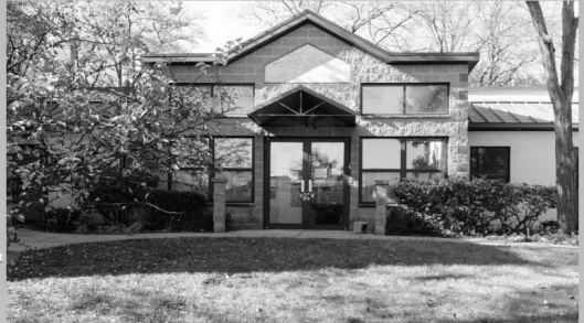
Tenney Nursery and Parent Center 1321 E. Mifflin St. Madison, WI 53703

Let's learn together! ☆ Play-based Curriculum