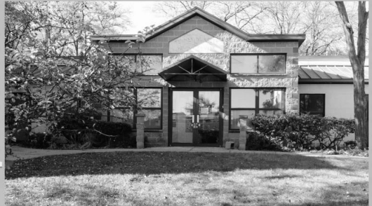
Tenney Nursery and Parent Center 1321 E. Mifflin St. Madison, WI 53703