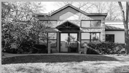
Tenney Nursery and Parent Center 1321 E. Mifflin St. Madison, WI 53703