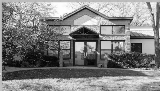
Tenney Nursery and Parent Center 1321 E. Mifflin St. Madison, WI 53703

Let's learn together! ☆ Play-based Curriculum